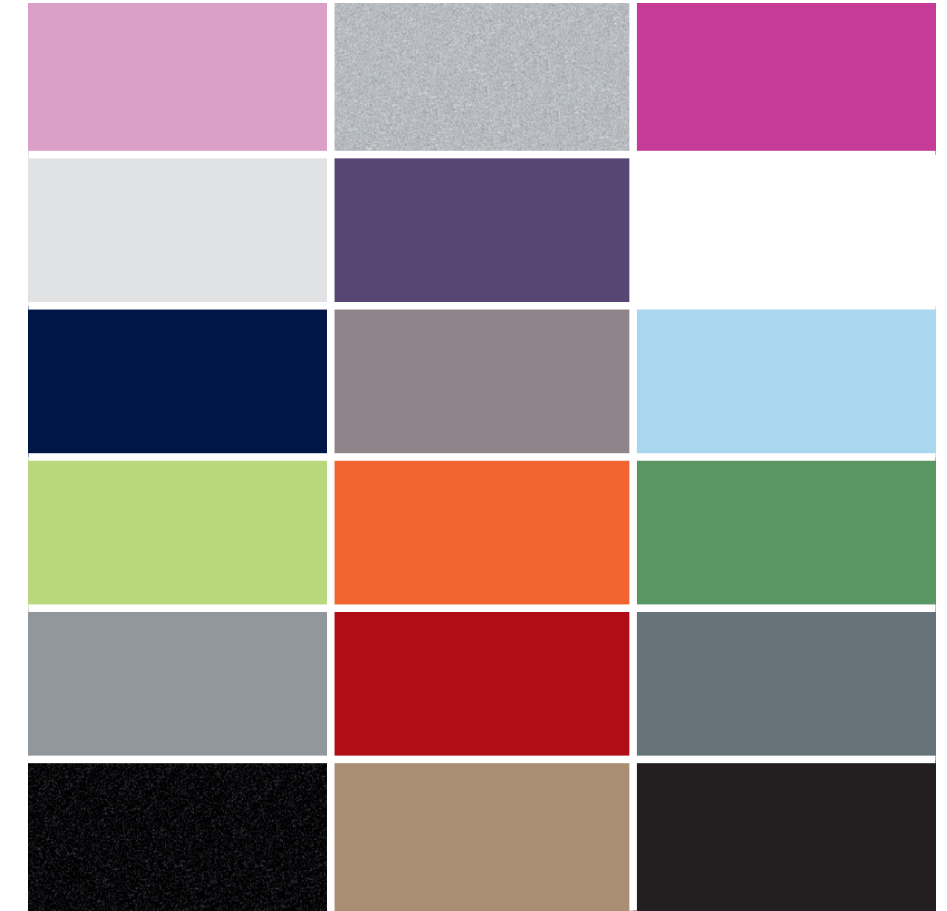
Magnetic glass boards for home and office - Danish Design