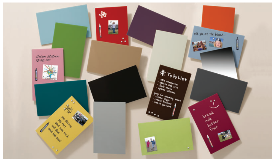
Combining and mixing CHAT-BOARDS and CHAT-BOARD SHELVES – gives you brand new possibilities in adding Danish Design to your home and office.